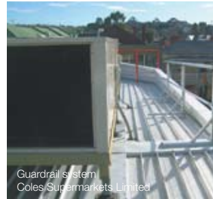
Guardrail system Coles Supermarkets Limited