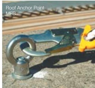
Roof Anchor Point MFB