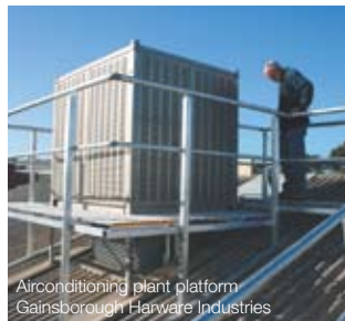
Airconditioning plant platform Gainsborough Hardware Industries