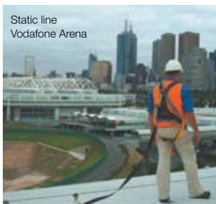
Static line Vodafone Arena

How can we help you? Find out about our other products and services, call us today on 1300 552 894.