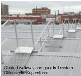
Cleated walkway and guardrail system Officeworks Superstores