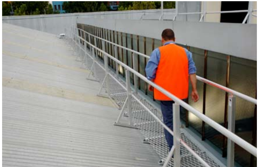
A walkway keeps workers off a potentially brittle roof.

The workload associated with Level 4 controls is also problematic. Apart from the ongoing responsibilities of training and so on of Level 3, the controller of the workplace is responsible for emergency rescue procedures, including the cost of a