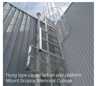
Rung type caged ladder and platform Mount Scopus Memorial College

How can we help you? Find out about our other products and services, call us today on 1300 552 894.