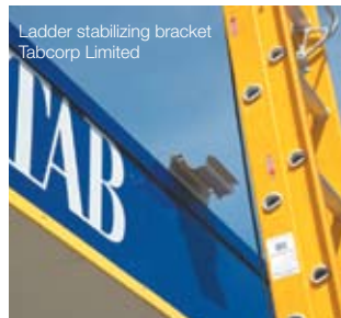
Ladder stabilizing bracket Tabcorp Limited