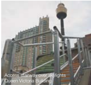
Access stairway over skylights Queen Victoria Building